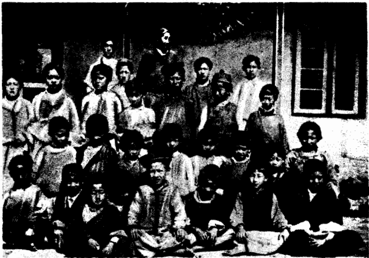
BOYS OF DAWASANDUP'S SCHOOL