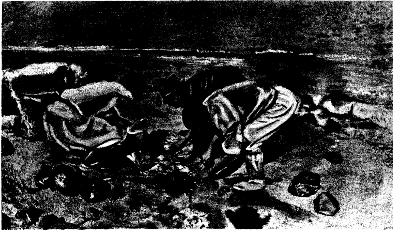
A TIBETAN FUNERAL—CUTTING THE DEAD BODY INTO PIECES TO FEED THE VULTURES AND WILD BEASTS